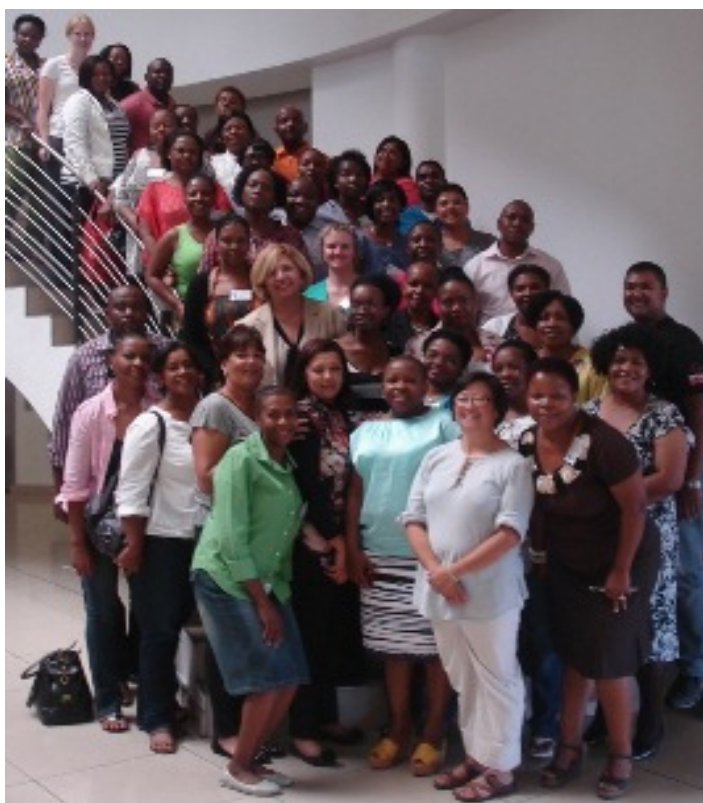
GERMS-SA Surveillance Officers' meeting at Genesis Conference Centre (7-8 March, 2013)

Enjoy this bumper issue of the LINK in which we look at the future of GERMS, report back on our very successful SO meeting (pg 2) and pictorially document the site visits covered these last four months (pgs 4 and 5). We also give you information on how we monitor GERMS-SA data quality (pg 6) and give you updates on our projects: the IPD case-control study (pg 7 and 8), the Health